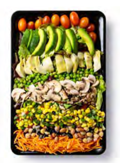
Dawn's Vegan 🕠 🕡 Balsamic Vinaigrette dressing