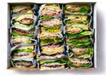
Deluxe Sandwich Tray 18 Gourmet half sandwiches. See page 13 for more info.