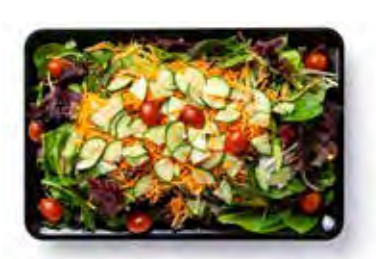
Mixed Greens Salad Platter 🕠 See page 15 for more info.