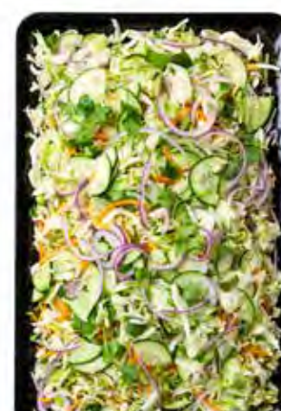
Spicy Thai Peanut 🕚 Spicy Thai Peanut dressing