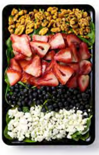
Spinach, Berry & 🕚 Goat Cheese