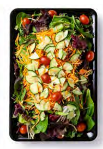
Mixed Greens 🕚 Balsamic Vinaigrette dressing