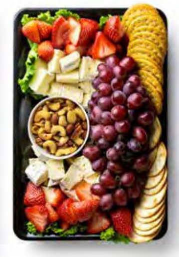
Fruit, Brie & Nut Platter (V)