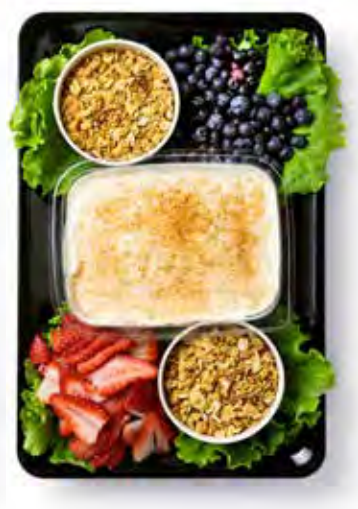
Yogurt, Fruit & Granola Platter (7)