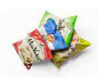
Assortment of 10 See Specialtys.com for more info.