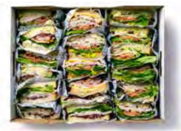
All Meat Sandwich Tray 18 Classic half sandwiches. See page 13 for more info.