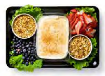
Yogurt, Fruit & Granola Platter 🚺