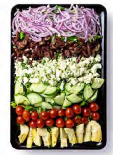
Greek Goddess 🕚 Greek Goddess dressing