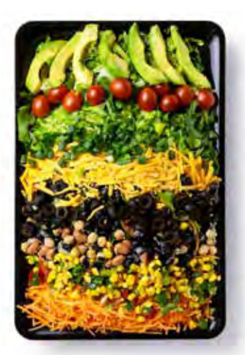
Southwestern (1) Spicy Southwestern dressing