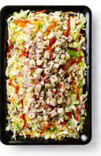
Chinese Chicken Pan-Asian dressing