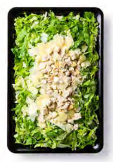
Chicken Caesar Caesar dressing