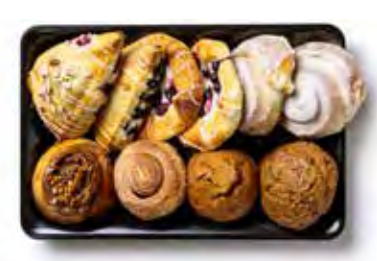
Classic Breakfast Platter

10 assorted freshly baked pastries. See page 6 for more info.