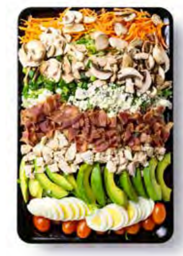
Chicken Cobb Ranch dressing

Group versions of our featured salads. Serves 10 as a side.