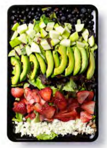
Balsamic, Berry and ( V ) Avocado

Group versions of our featured salads. Serves 10 as a side.