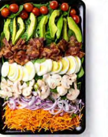
Spinach & Bacon Poppy Seed dressing