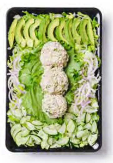
Good Fortuna Poppy Seed dressing